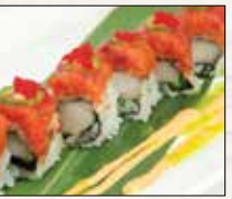
Spicy Girl Roll