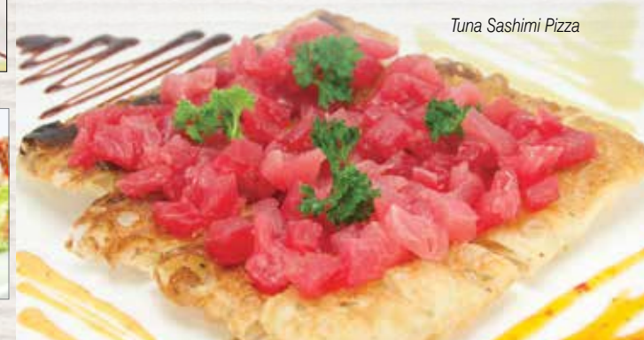
Tuna Sashimi Pizza