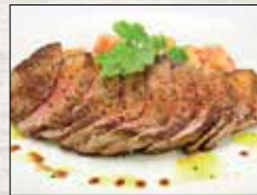
Sirloin Steak, Asian Style

Steamed Jasmine Rice 3 Brown Rice 3.5 Sushi Rice 3.5 Sweet Potato Fries 8