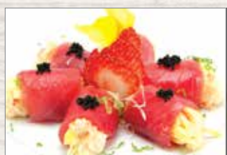
Spicy Lobster Cha La Ca