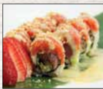
Crazy Tuna Roll