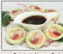
Rainbow Naruto Roll