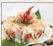
Miso Lobster Roll