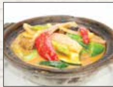
Veg & Tofu Thai Curry

VEGETABLE 13 CHICKEN 14 SHRIMP 15 SEAFOOD 17