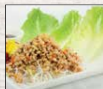
Chicken Lettuce Wrap