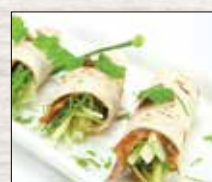
Crispy Peking Duck