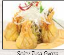
Spicy Tuna Gyoza