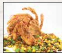
Soft Shell Crab Tempura