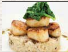
Pan-Seared Sea Scallops

Crispy Orange w~ WHITE MEAT CHICKEN 17 JUMBO SHRIMP 19