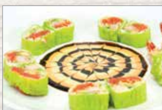
New Rochelle Roll