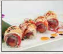
Out of Control Roll