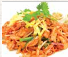
Chicken Pad Thai