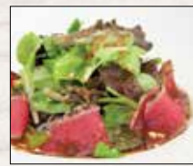
Seared Tuna Salad